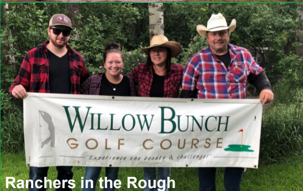
Ranchers in the Rough