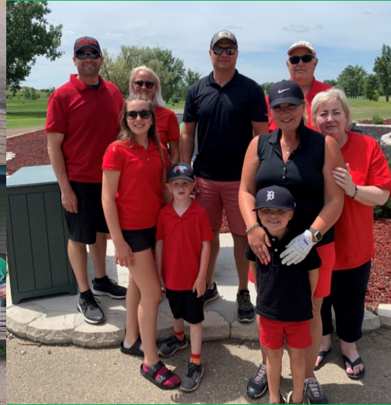
On Eagle's Wings, Estevan, SK