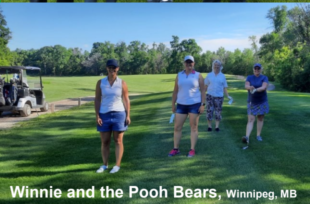
Winnie and the Pooh Bears, Winnipeg, MB

THANK YOU! TO EACH AND EVERY ONE WHO GOLFED, SPONSORED, DONATED AND SUPPORTED OUR CHARITY AUCTION. YOU MADE THIS OUR BEST CHARITY GOLF CLASSIC YET RAISING $20,550